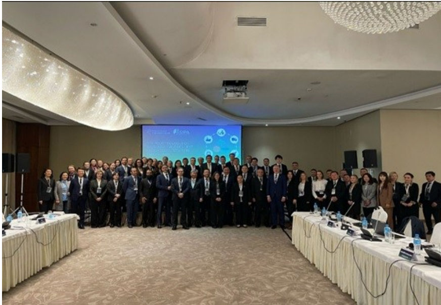
Group Photo from SIPA Dialogue

On 11-12 March 2025, the SIPA Policy Dialogue on Sustainable and Resilient Freight Connectivity in Central Asia took place in Almaty, Kazakhstan. The event was organized by the International Transport Forum (ITF), the Ministry of Transport of Kazakhstan, the International Climate Initiative (IKI), the Organization for Economic