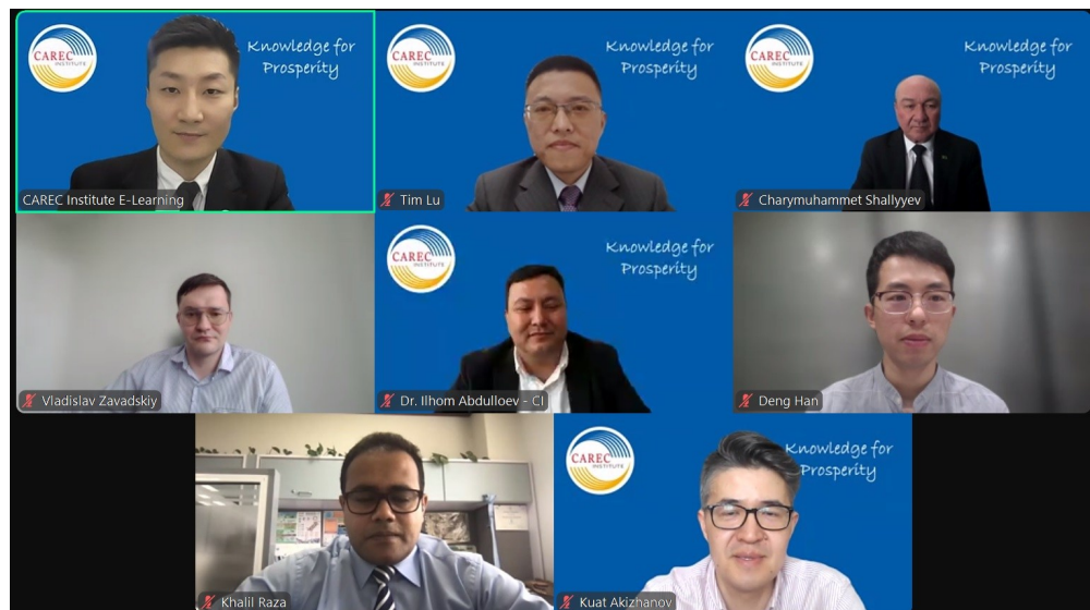
Group Photo from Policy Dialogue on Electric Vehicle Deployment in the CAREC Region