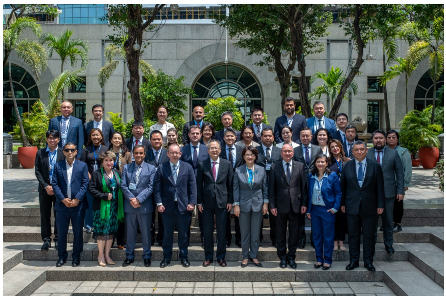
Group Photo from CAREC NFP Strategic Planning Meeting

The meeting emphasized the need for collaboration between multiple stakeholders. A key result was the strengthened recognition of CI’s role in driving evidence-based solutions to speed up green transitions and digital modernization in CAREC member countries.