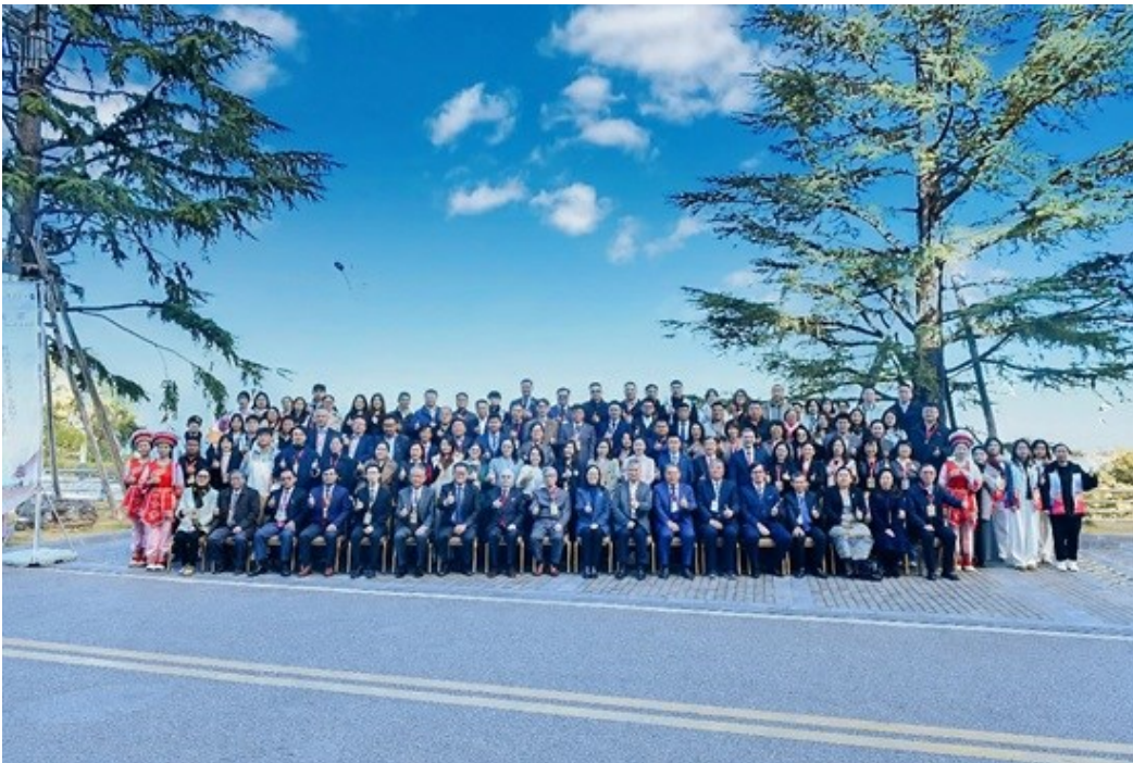
Group Photo of Dali Forum in Yunnan