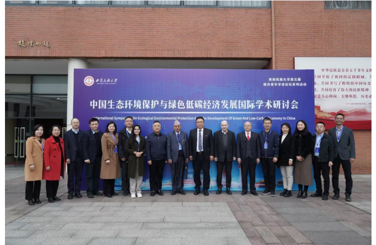
Group Photo of International Symposium on Ecological Environmental Protection and the Development of Green and Low-Carbon Economy

Dr. Hans also addressed the concerning levels of greenhouse gas emissions per unit of GDP in several CAREC countries, urging policymakers to prioritize sustainable practices in key sectors such as energy and agriculture. By promoting collaboration and investing in sustainable solutions, the CAREC region can not only mitigate the adverse effects of climate change but also lay the foundation for a more