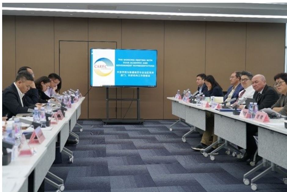
CAREC Institute Strengthens Academic and Governmental Collaboration in Host City

The meeting concluded with a strong commitment from the CAREC Institute to deepen ties with academic institutions and research organizations across Xinjiang. By fostering such collaborations, the CAREC Institute envisions a future where regional partnerships drive innovation, growth, and prosperity for all member countries.