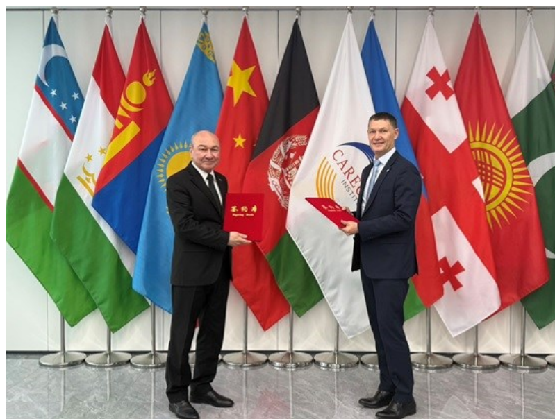
CAREC Institute and EFSD Sign a MOU

This partnership marks a significant milestone in the history of both organizations and promises to catalyze further initiatives aimed at fostering development and stability in the region.