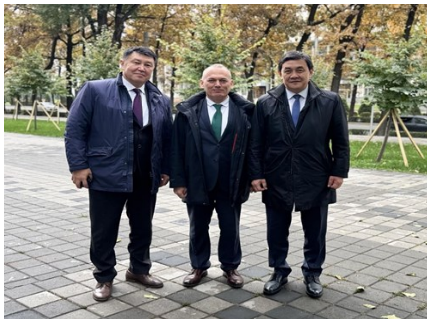
Mr. Kabir Jurazoda Meets with Representatives of the National Institute for Strategic Initiatives

The institute was established through the consolidation of existing structures within the Kyrgyz Republic. It serves as the central entity providing scientific research, analysis, information, and training support to the Government in the areas of economics, politics, security, and public administration. Operating under the direct supervision of the Prime Minister, it is the sole institution of its kind affiliated with the highest authorities of the Kyrgyz Republic.