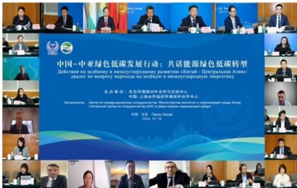
Group photo of the China-Central Asia Green and Low-Carbon Development Action Conference

The conference reaffirmed the importance of strong regional cooperation, backed by research, knowledge-sharing, and policy frameworks that promote private sector involvement and foreign investment in renewable energy technologies, particularly energy storage. Participants concurred those continued efforts in policy alignment, technology exchange, and shared best practices are essential to achieving the green development goals set out during the China-Central Asia Summit.