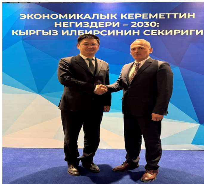
Mr. Kabir Jurazoda Meets with Mr. Sanzhar Bolotov, Deputy Minister of Economy and Commerce and National Focal Point for the Kyrgyz Republic

This meeting set a strategic path for continued collaboration, fostering regional cooperation in transport, climate finance, and sustainable development.