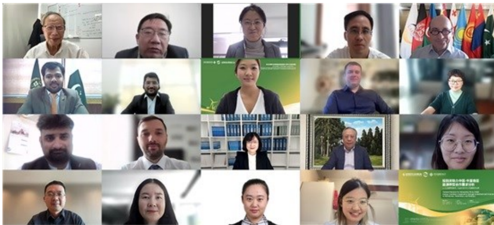
Group photo of Virtual Dialogue on Advancing Energy Transition in CASA Region Conference

The event concluded with a strong call for enhanced capacity building, underscoring the importance of joint education and training initiatives to foster a resilient energy transition throughout Central and South Asia.