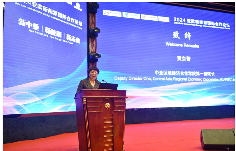
Dr.Huang Jingjing Speaks at the Asia-Europe New Energy International Cooperation Forum

Dr. Huang further noted that the CAREC Institute's efforts to foster regional cooperation will play a significant role in supporting the transition to green energy solutions. By promoting sustainable development and enhancing collaboration among member countries, the institute aims to benefit all nations involved in the shift toward cleaner, more efficient energy sources.